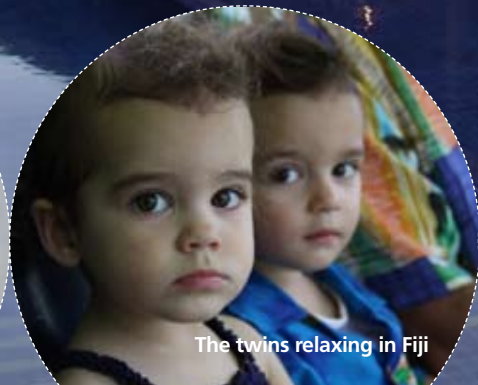
The twins relaxing in Fiji