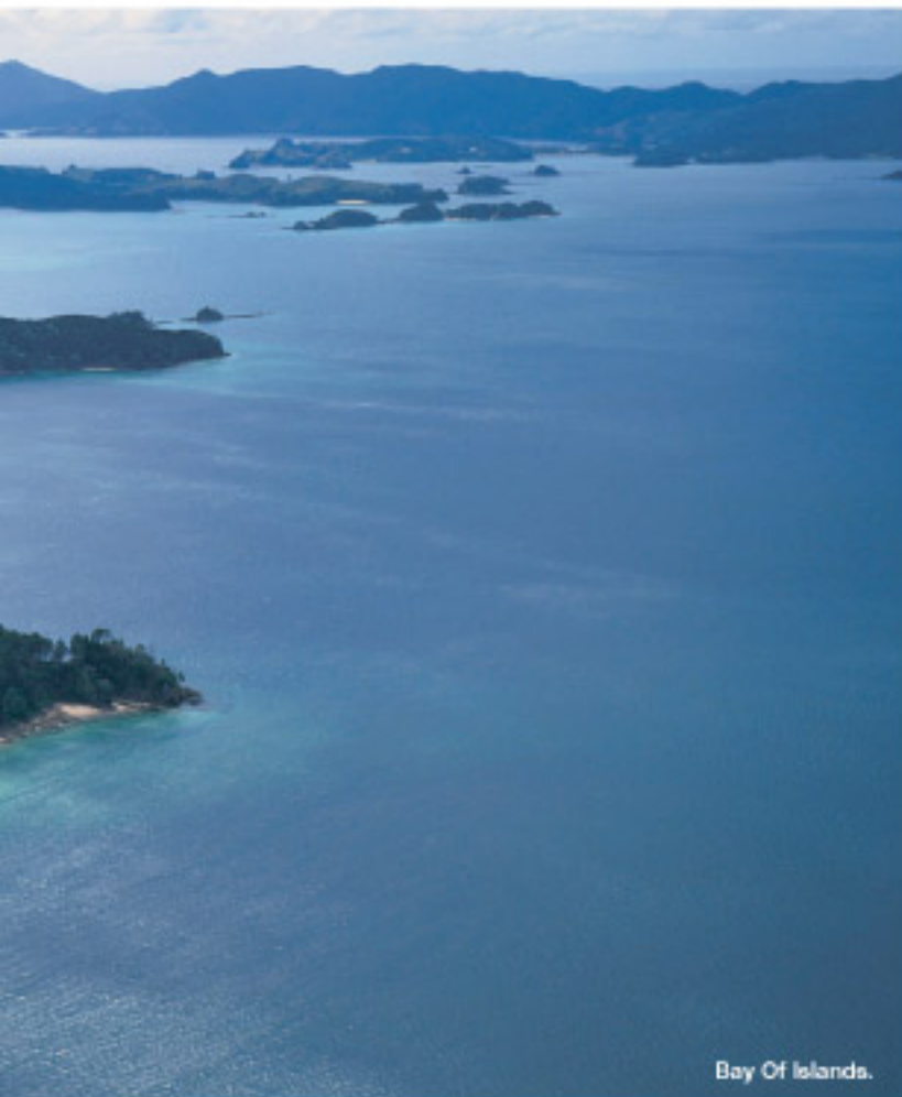
Bay Of Islands.

Waiheke Island can be reached by ferry from Auckland and is home to an eclectic mix of winemakers, olive growers and white-collar executives who commute to downtown Auckland by ferry.