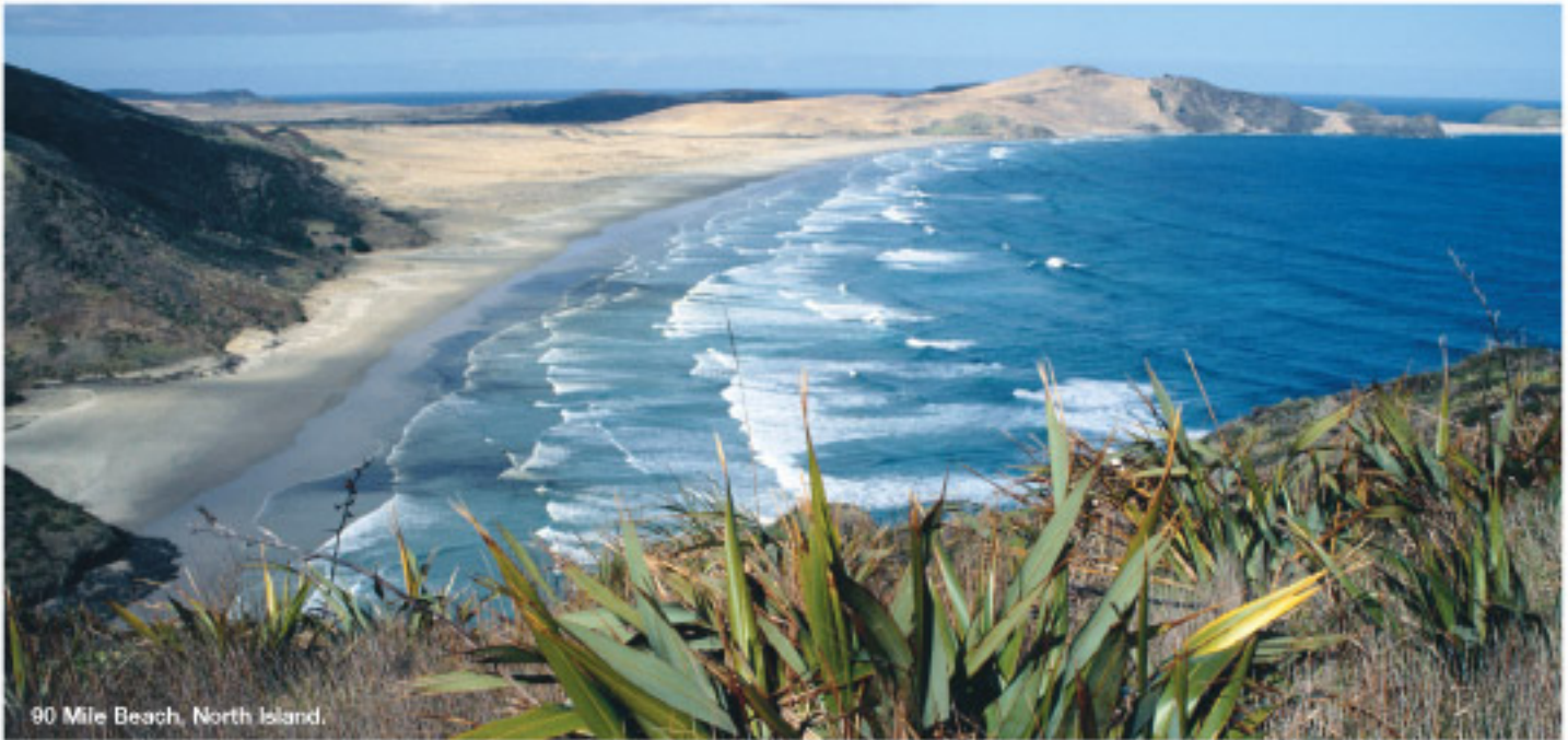
90 Mile Beach, North Island.