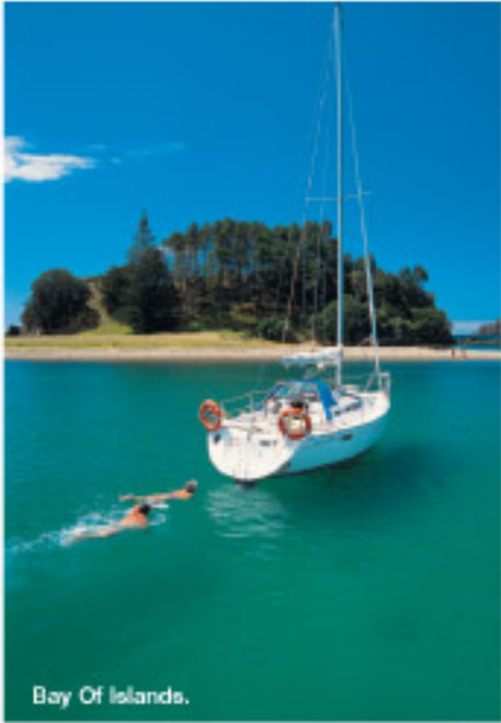
Bay Of Islands.