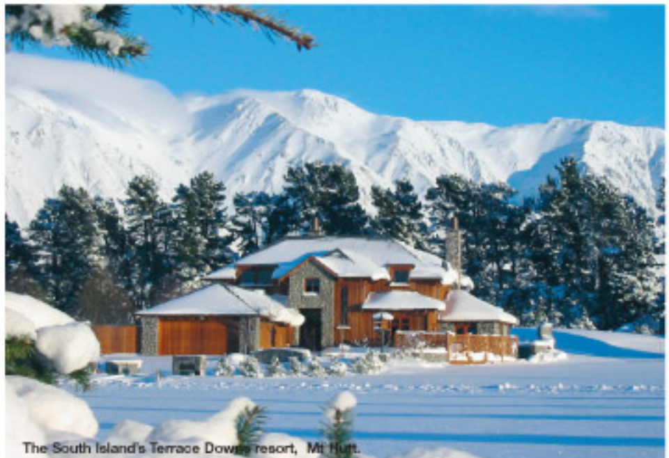
The South Island's Terrace Downs resort, Mt Hutt.