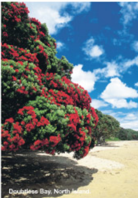
Doubtless Bay, North Island.